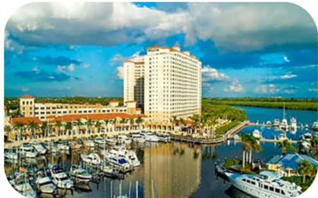
Exhibit and sponsorship opportunities for the 2026 FHEA Fall Expo & Education Conference ,

November 7 – 10, at the Westin Cape Coral Resort at Marina Village, will be available soon. Tabletops will be limited, so you won't want to miss out when registration opens.