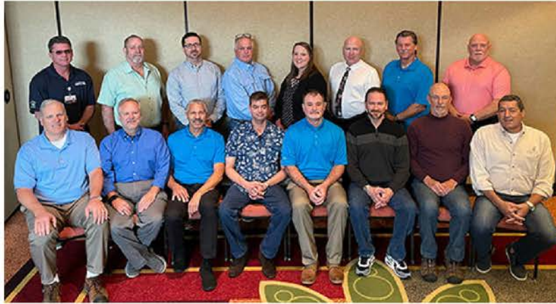
Front row (L-R)